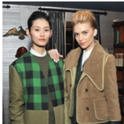
The Pre-Autumn Leaves Start Changing Color