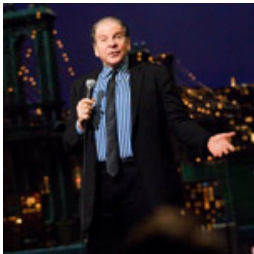
Comedy Gatekeeper Who Makes Letterman Laugh